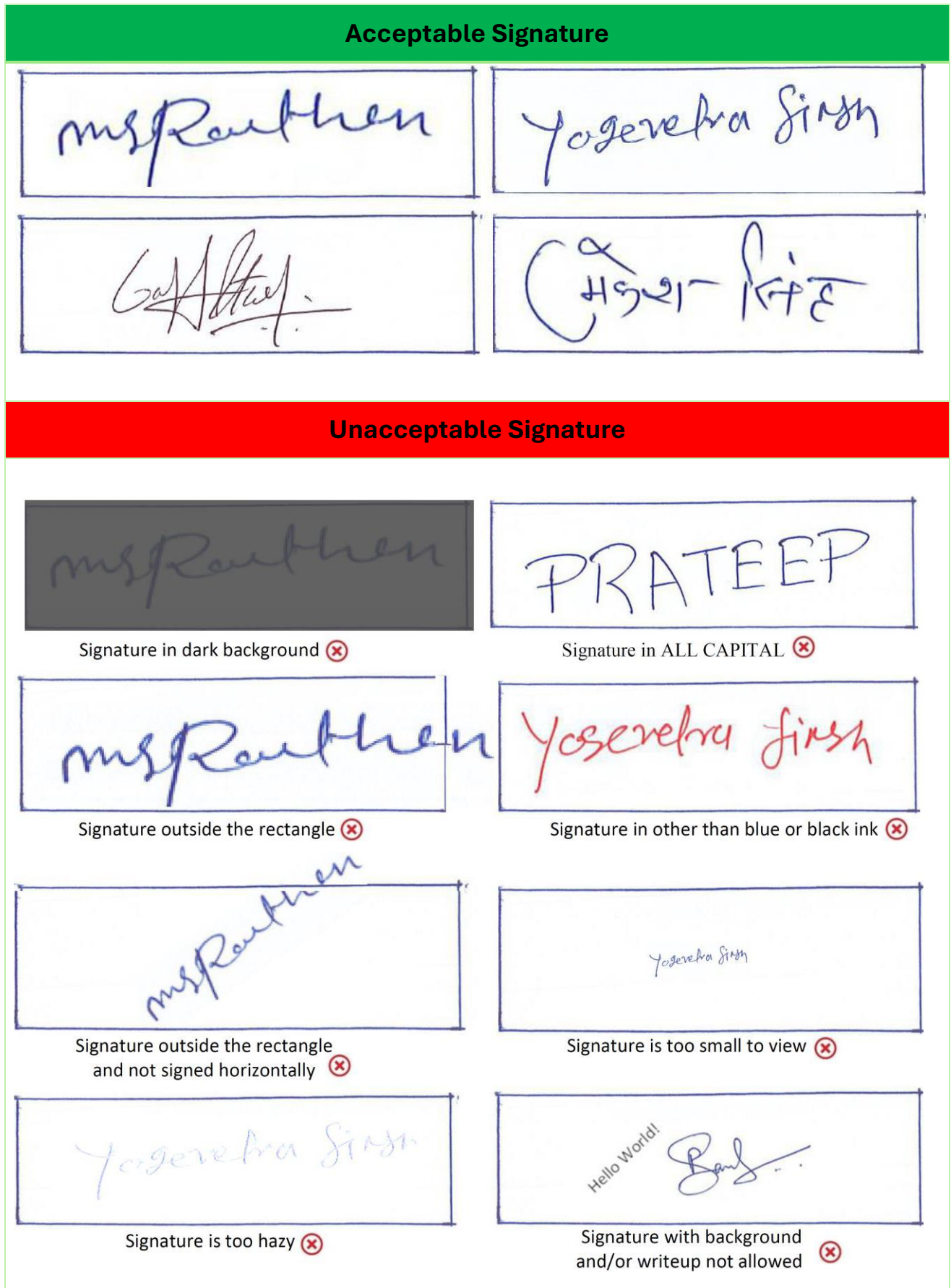
Table 10: Samples of acceptable and unacceptable signatures