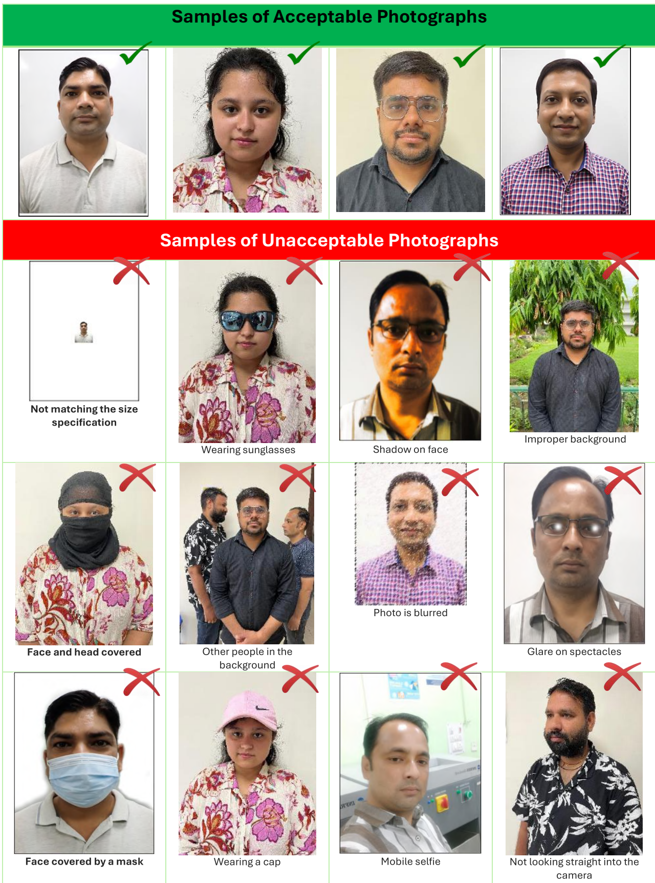
Table 9: Samples of acceptable and unacceptable photographs